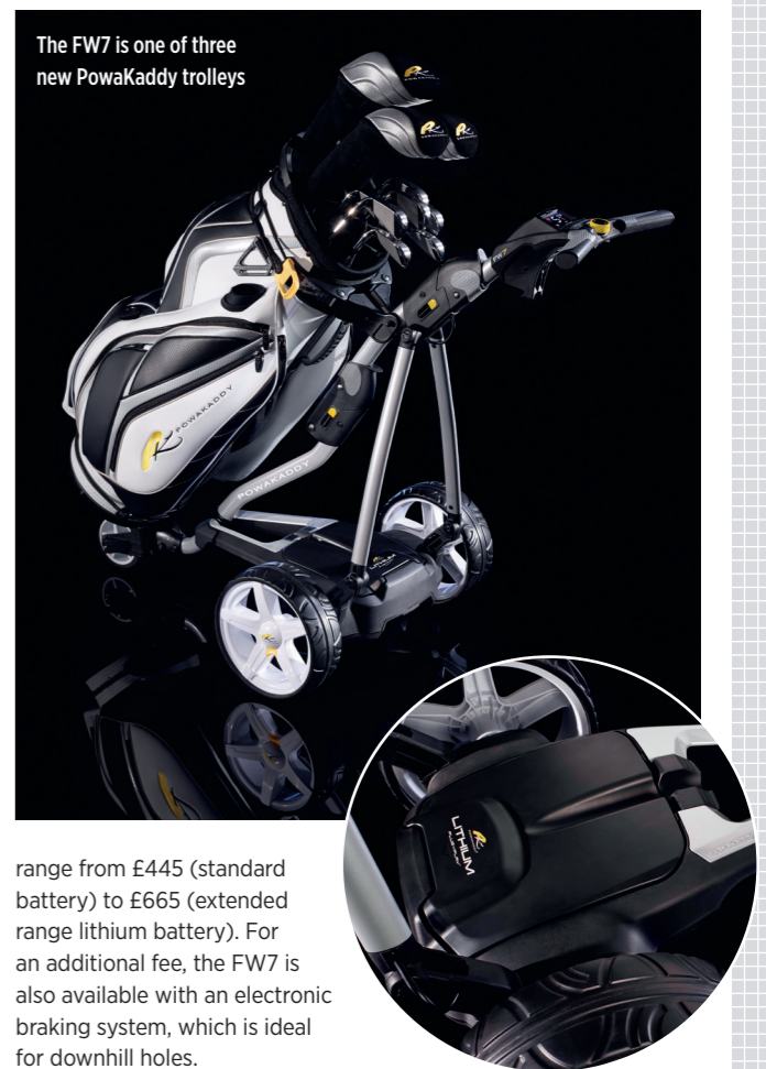
The FW7 is one of three new PowaKaddy trolleys

PowaKaddy says the final trolley of the three, the FW7, is the perfect combination of 21st-century engineering and cutting-edge digital functionality. Its features include a specific speed display and distance measurement, and a 'competition' mode, which removes features banned in a competition environment. Prices