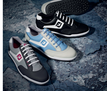
Street styling for on and off-course use

The new shoes use full-grain leather for an extremely soft, breathable upper, a PU Film membrane to provide waterproof protection, and a PU with Nylex-covered FitBed for cushioning. Spikeless traction and stability is delivered via a low-profile, DuraMax rubber outsole.