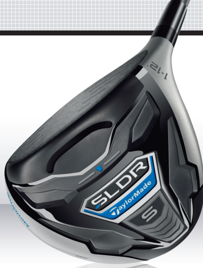
A contrasting face and crown design gives the SLDR Mini driver a distinctive look