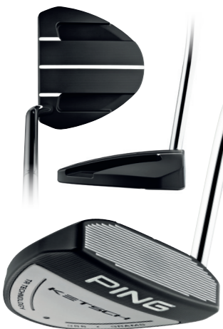
Ketsch features bold sight lines

There's also a choice between a fixed-length shaft (£175), a counterbalanced fixed-length shaft (£200), an adjustable-length shaft (£199) – which can be modified between 31 and 38 inches – and a counterbalanced adjustable-length shaft (£224).